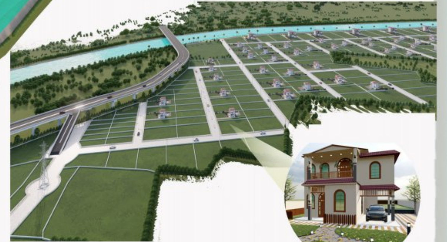
FARM HOUSE VIEW