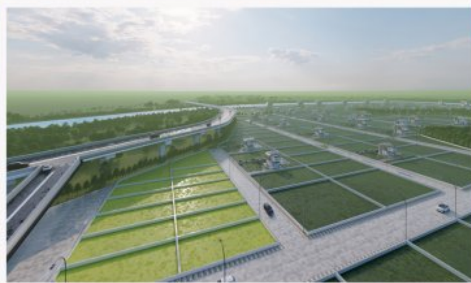
ARIEL VIEW OF FARMS